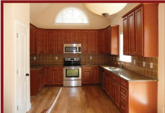
Beautiful Cabinets - Granite Counters