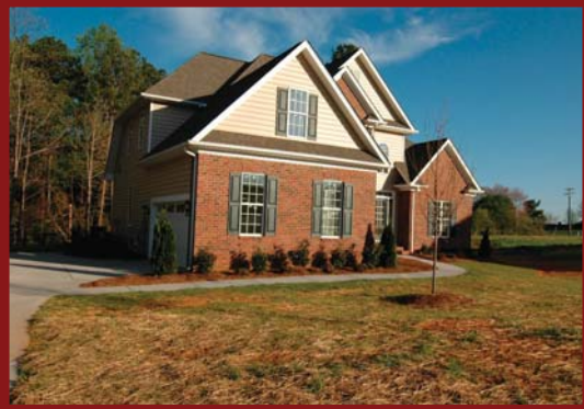
4 Bedroom, 3 Bath Plus Bonus Room