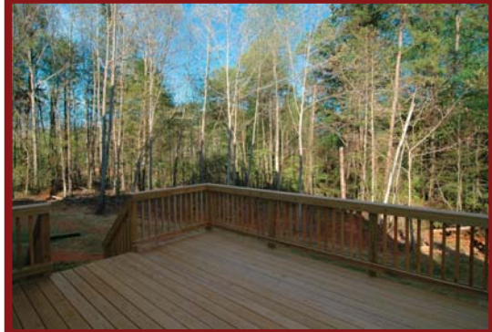
.94 Acre Homesite, large rear deck