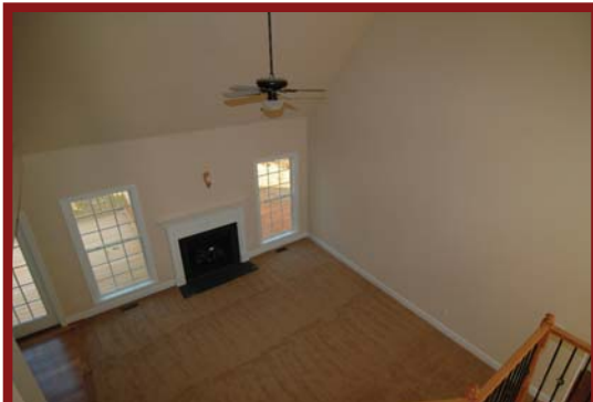
Fireplace in 2-Story Family Room