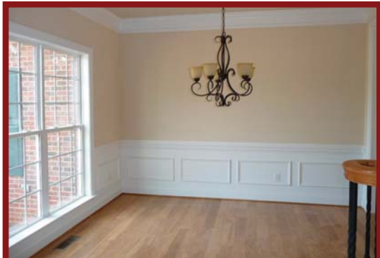
Dining Room with Picture Molding