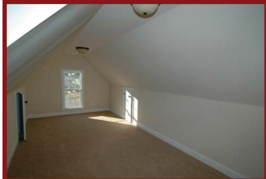
Finished Bonus Room