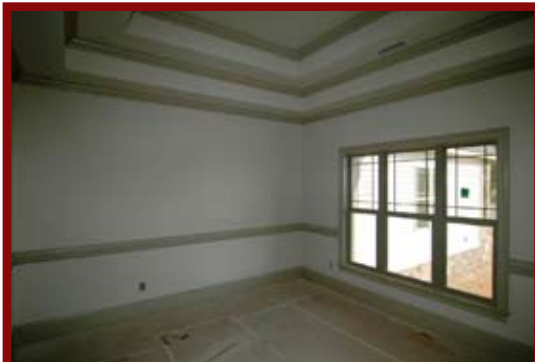
Trey ceilings and hardwoods in Dining