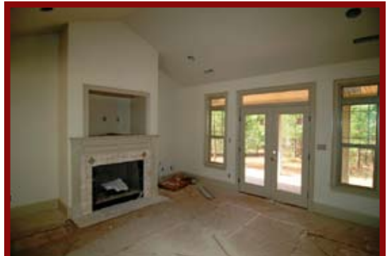
Greatroom w/ fireplace, opens to covered deck