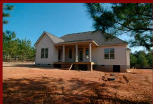
Large lot with lots of space from your neighbors