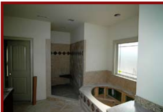
Master Bath with garden tub and tile shower