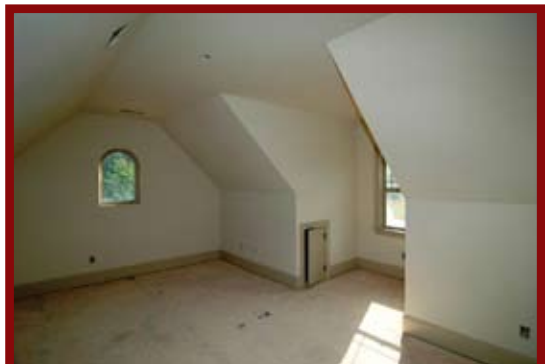
Bonus Room over Garage